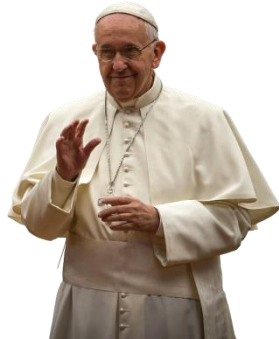
POPE FRANCIS REQUIESCAT IN PACE 1936 - 2025