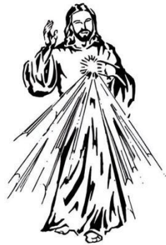
DIVINE MERCY SUNDAY

MALAYALAM MASSES: Every 2 nd Sunday of the month @ 3:00pm